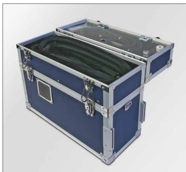
Expansion case for storing the heated sensor