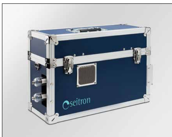
Housing in resistant aluminium