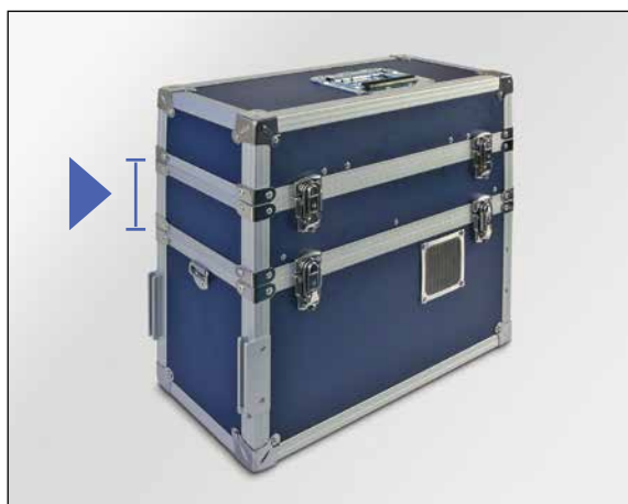
Housing extension drawer