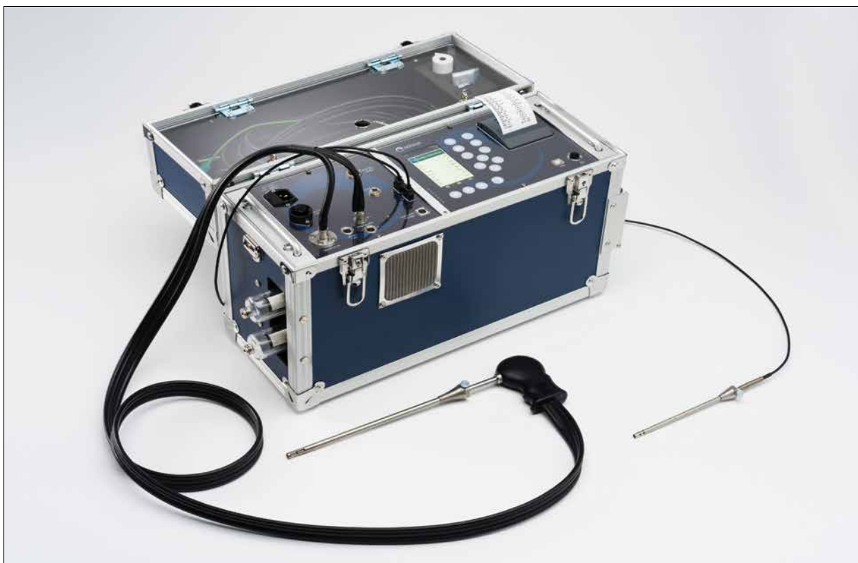
Chemist 900 with passive gas sampling probe and air temperature sensor