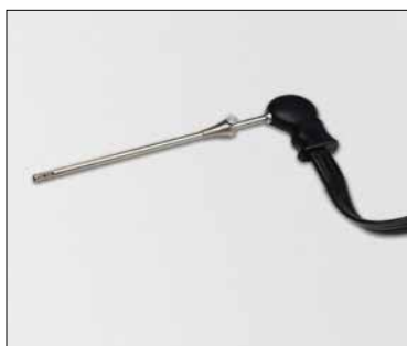
Passive gas sampling probe