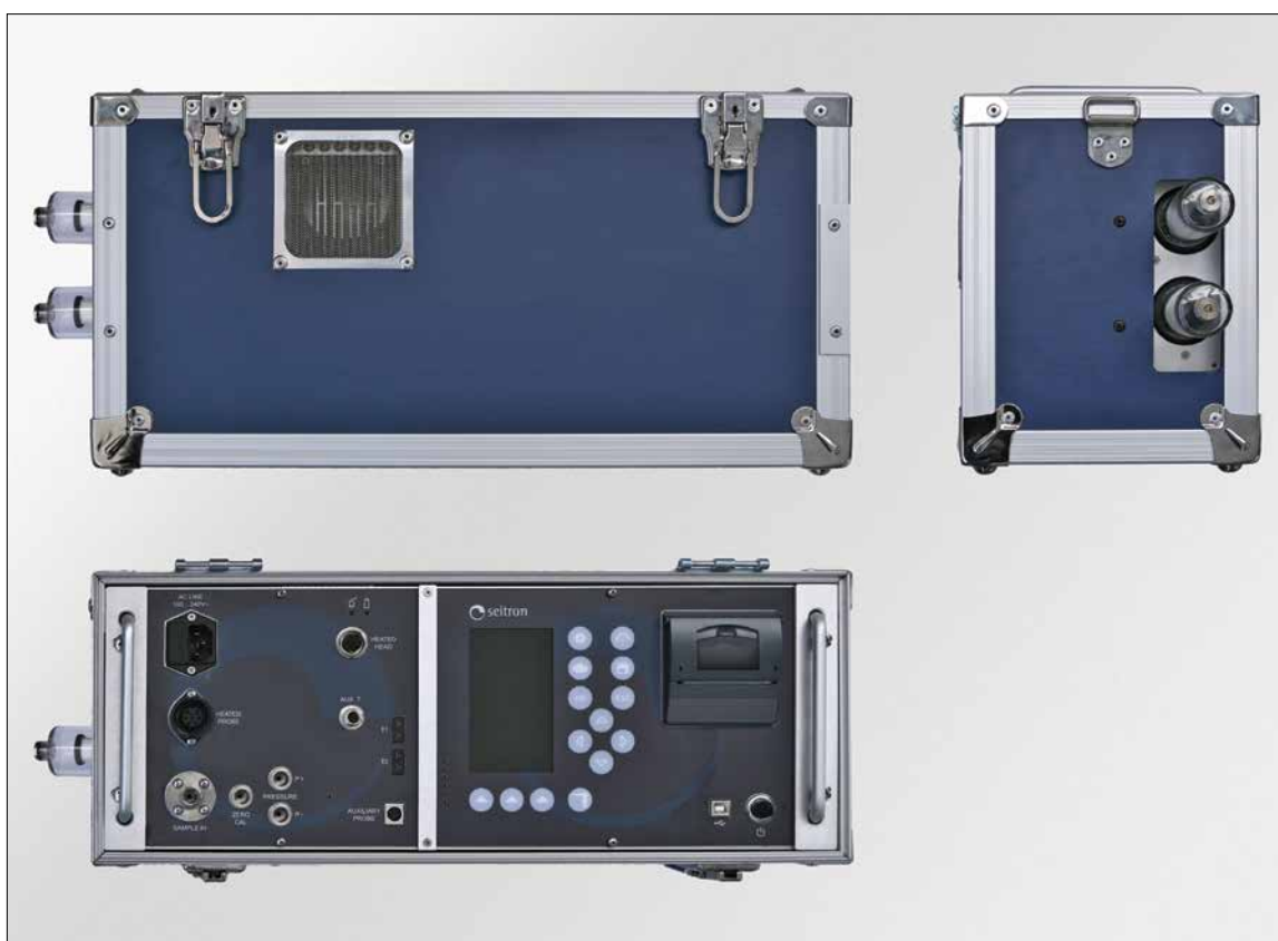
Orthogonal view - Chemist 900

*: The NDIR bench always measures the 3 gases CO, CO2 and CH4