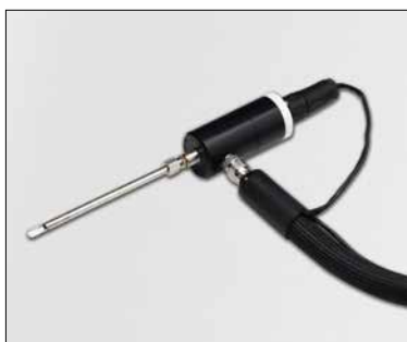
Active gas sampling probe with heated head and hose