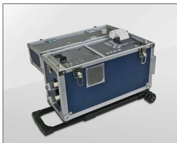
Chemist 900 can also be used with the trolley attached