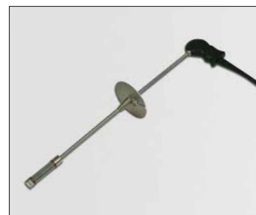
750 mm gas sampling probe for industrial motors