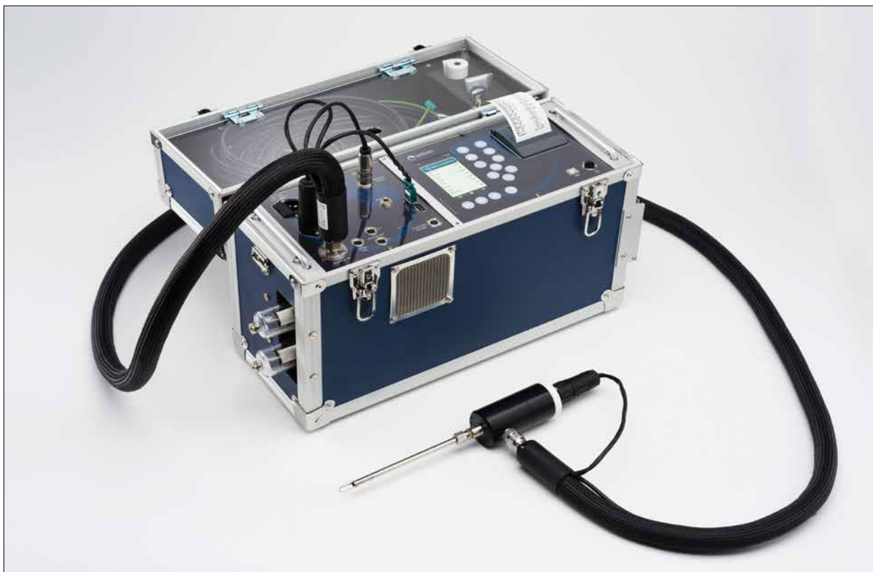
Chemist 900 with active heated gas sampling probe