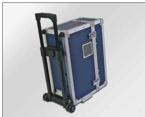
Trolley for transporting Chemist 900