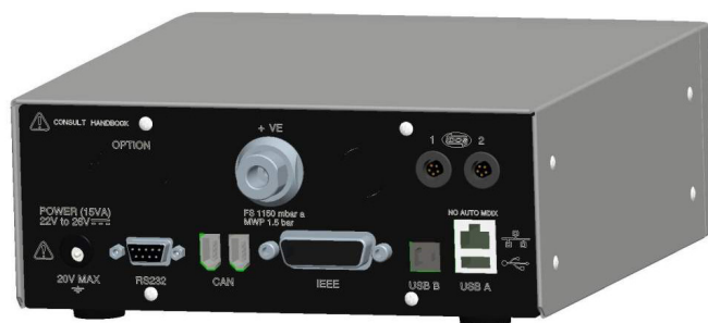
PACE1001 from the rear