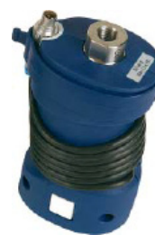
External IDOS universal pressure module