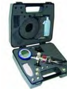
Hydraulic test kit

Includes: DPI 104-IS; ranges to 300 psi (20 bar), PV 211 pneumatic test pump, hose, adaptors, seal kit and case.