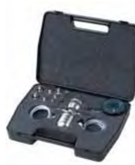
Low pressure pneumatic test kit

Includes: DPI 104-IS; ranges to 30 psi (2 bar), PV 210 low pressure pneumatic test pump, hose, adaptors, seal kit and case.