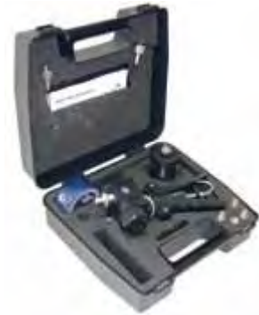
Pneumatic and hydraulic test kit