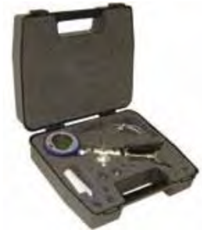
Pneumatic test kit