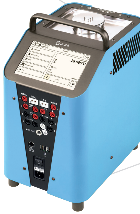
PTC255i integrated measuring instrument