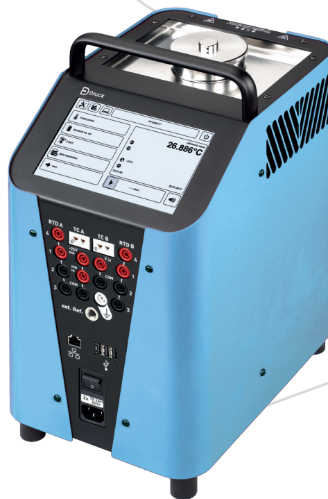
PTC165i Integrated measuring instrument