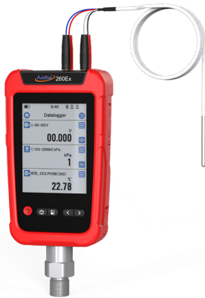
ADT260Ex with AM1602 temperature probe

Note: The ADT260Ex can be purchased without the ADT158Ex module If needed using the following part number: ADT260EX-NO