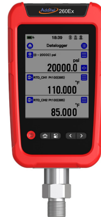
Additel 260Ex with ADT158Ex module