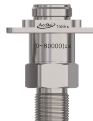
"ADT158Ex pressure module - for use with ADT260Ex (bottom mount)"