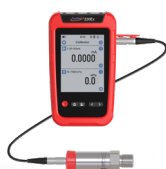
Additel 226Ex with ADT161Ex Pressure Module

[3] Precision Sensors (APXR and APXQ) cannot be configured as an Ex model and cannot be read by Ex device.