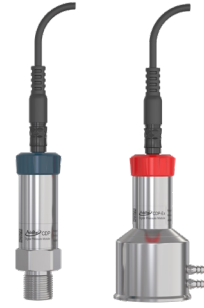
Gauge pressure Differential pressure