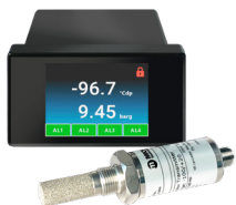
Easidew Advanced Online Dew-Point Hygrometer