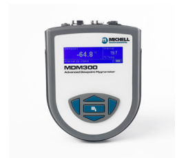
MDM300 Dew-Point Hygrometer