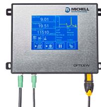
Optidew 501 Chilled Mirror Hygrometer