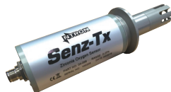
Senz-TX Oxygen Transmitter