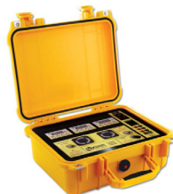
YellowBox Portable Portable Oxygen Analyzer