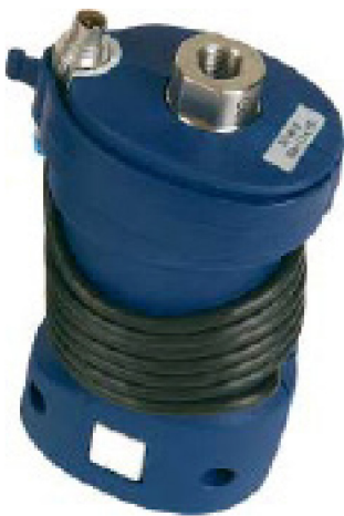
External IDOS universal pressure module

*Provides absolute pressure option in addition to gauge pressure. In absolute mode adds barometric pressure to gauge pressure range. For absolute mode ranges below 1 bar please consult your sales representative.