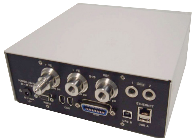
PACE1000 from the rear

UK Japan EU USA South Africa/India China Australia and New Zealand