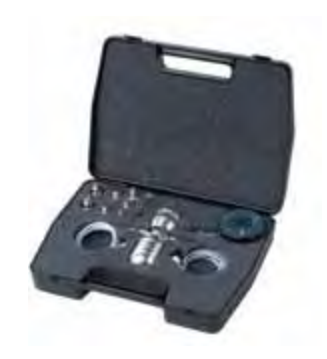
Low pressure pneumatic test kit

Includes: DPI 104; ranges to 700 bar (10,000 psi), PV 411A combined pneumatic and hydraulic test pump, hydraulic reservoir, hose, adapters, PRV, seal kit and case.