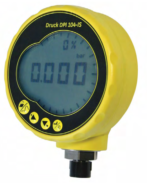
Hazardous Area pressure gauge