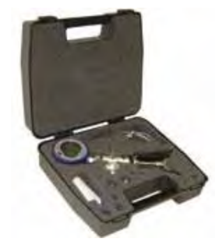
Pneumatic test kit