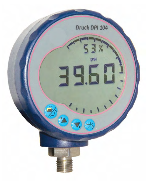
Safe Area pressure gauge