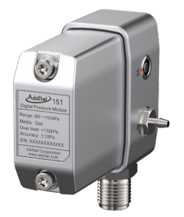
BP Pressure Module with Calibration Fixture