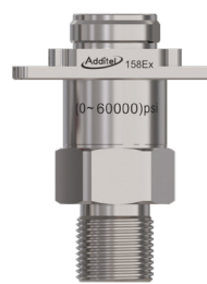
ADT158Ex pressure module - for use with ADT273Ex (bottom mount)