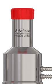
ADT161Ex pressure modules - See ADT161 Datasheet for more info