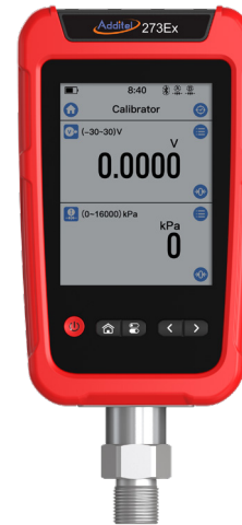
Additel 273Ex with ADT158Ex module