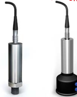
Gauge pressure Differential pressure