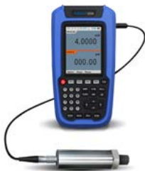
Additel 223A with ADT160A Pressure Module