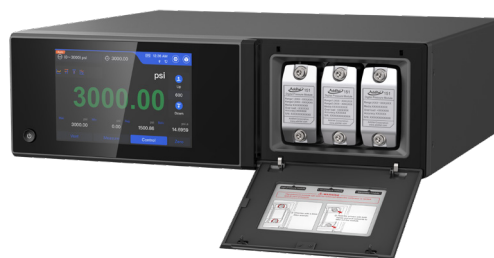
Additel 783 with ADT151 Pressure Module