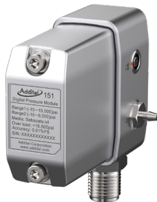
CP Pressure Module With Calibration Fixture

[1] A barometric pressure module is optional for ADT773/ADT783/ADT793. After inserting the barometric pressure module, the controller can be toggled to and from gauge and absolute pressure units.