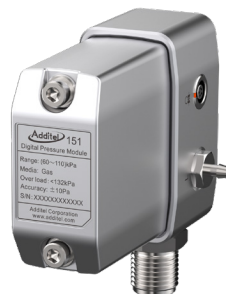
BP Pressure Module With Calibration Fixture